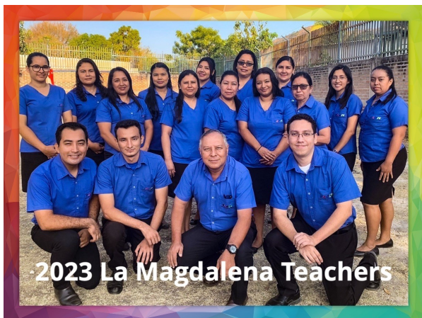
2023 La Magdalena Teachers

We are blessed to have such dedicated teachers and staff at the La Magdalena Christian School. They love the students and they love God. They are very happy to be a part of what God is doing in their school.